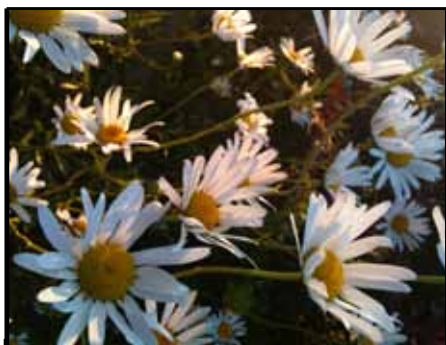
Summer Flowers. Smile!